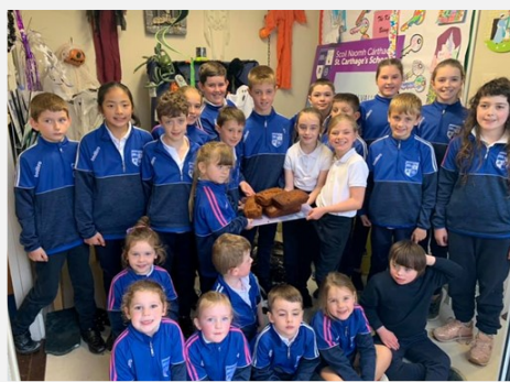
Our pupils with their delicious B á ir ín Breac

We had a "spooktacular" week in Ballyfinane N.S. for Halloween. Everyone enjoyed all of the activities throughout the week.