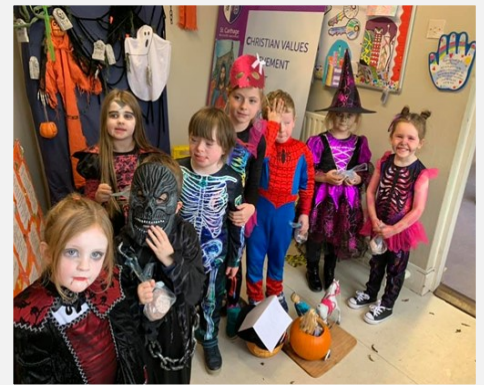
Our pupils looking wonderful in their Halloween costumes