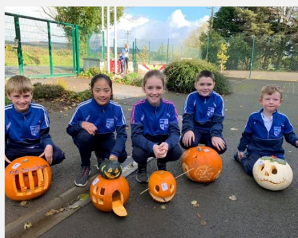
Our Pumpkin Carving Competition